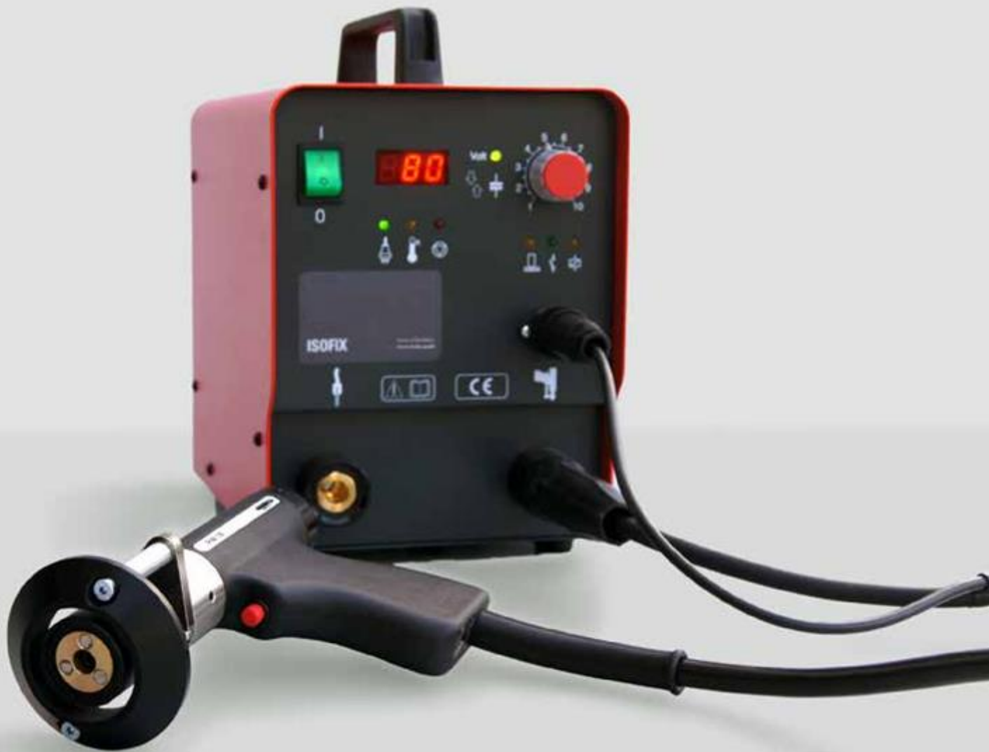
PIM-1B STUD WELDING GUN FOR WELDING CUPPED HEAD PINS