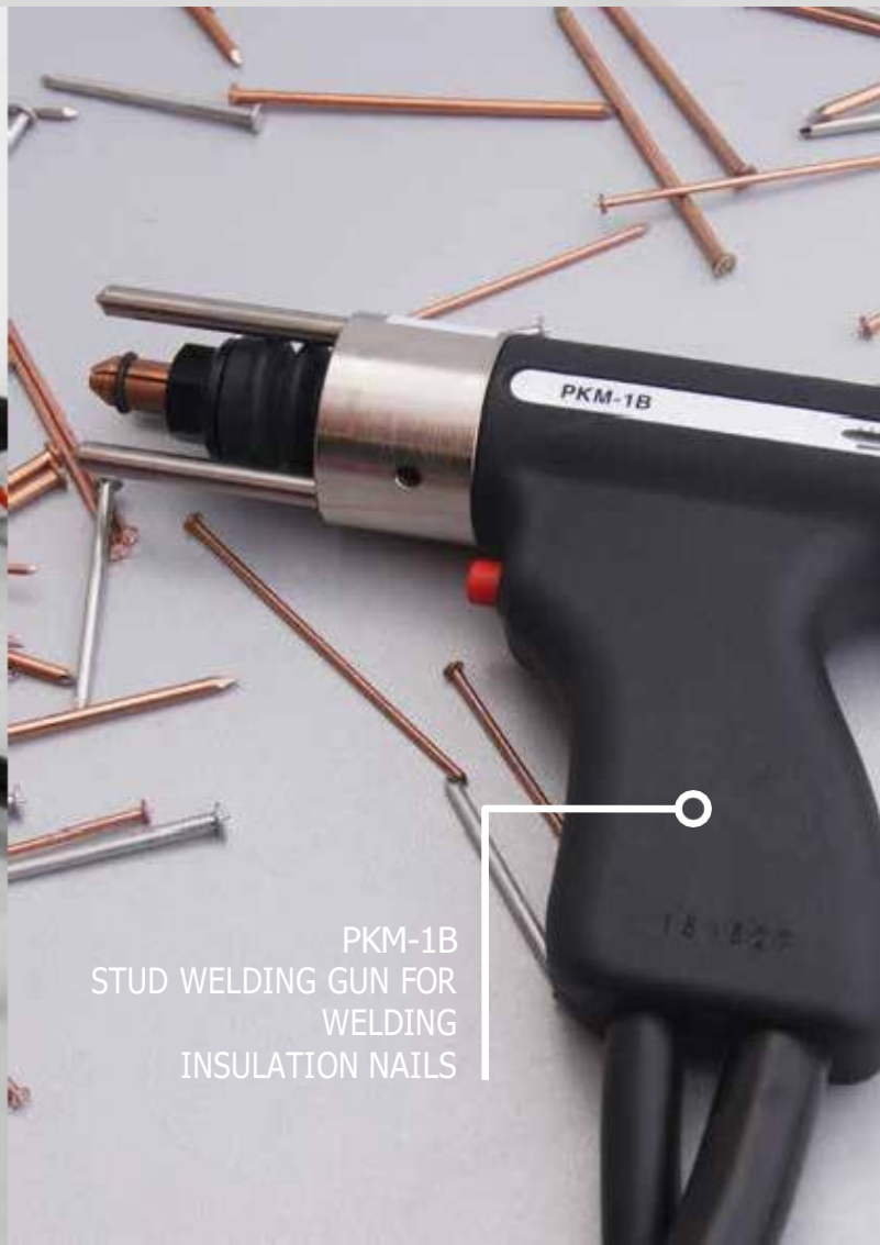
PKM-1B STUD WELDING GUN FOR WELDING INSULATION NAILS